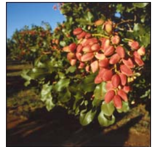
Pistachios hang in clusters on the tree in their rosy outer shells prior to harvest.

Like other nuts, the pistachio is "heart smart;" low in saturated fat and cholesterol free.